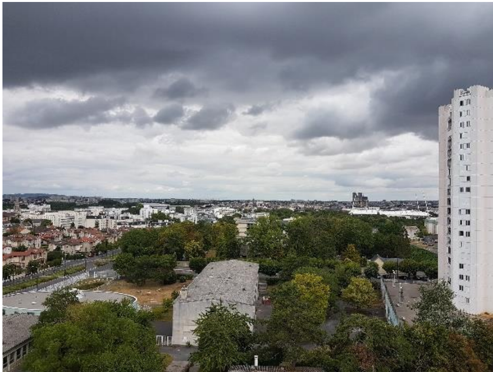
View from the Paul Fort residence

EUROPA-UNIVERSITÄT VIADRINA FRANKFURT (ODER)