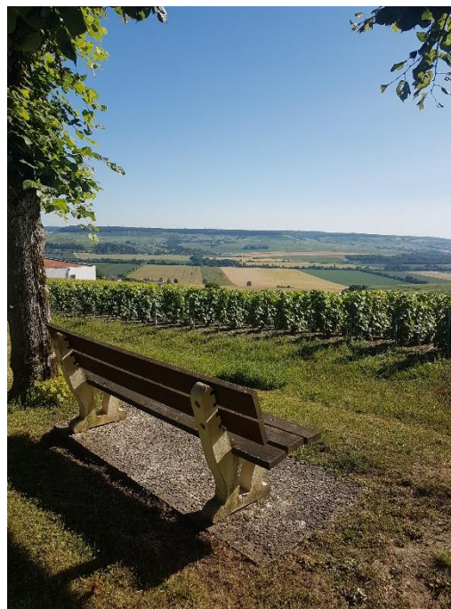
Chatillon Sur Marne, Accessible by car