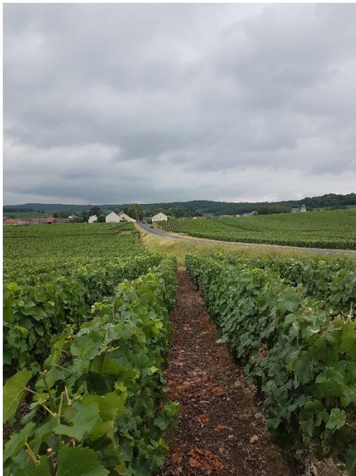
Rilly-la-Montagne 10 min. from Reims by train

EUROPA-UNIVERSITÄT VIADRINA FRANKFURT (ODER)